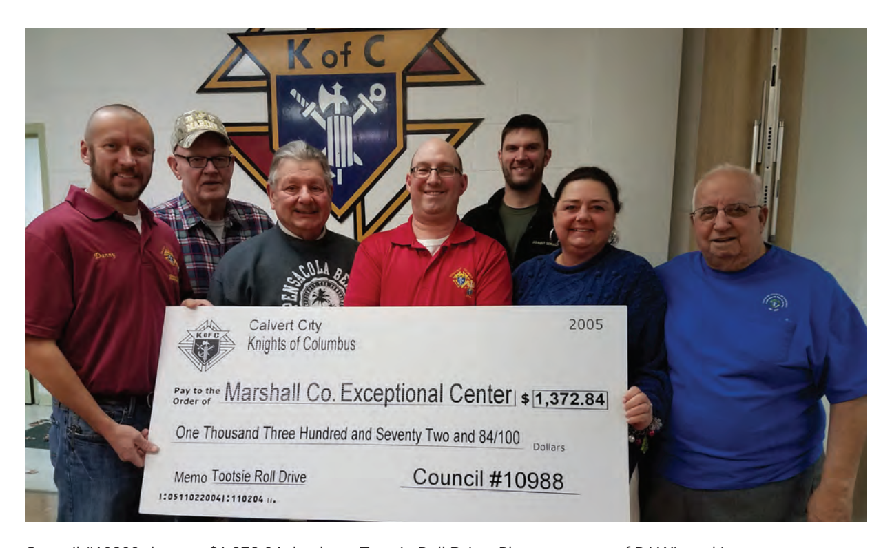
Council #10988 donates $1,372.84 thanks to Tootsie Roll Drive.