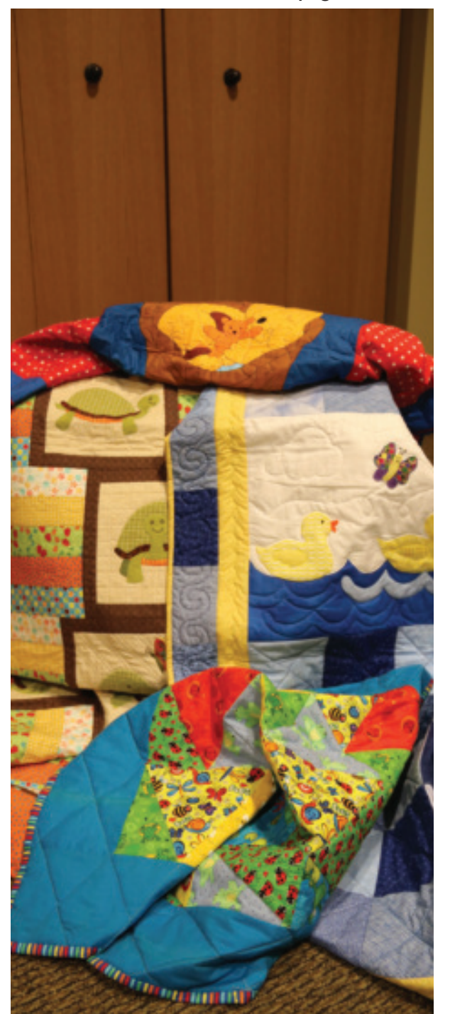
A variety of the baby quilts are displayed on Oct. 3.