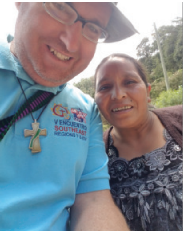
Continúa en página 20