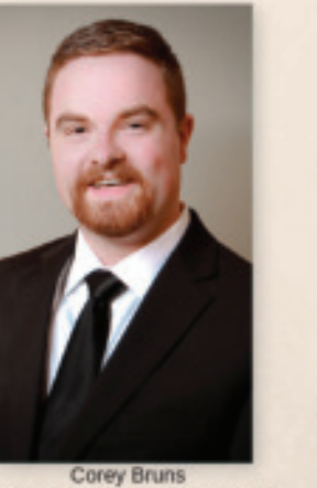
Segundo año de Teología en el Seminario de San Meinrad