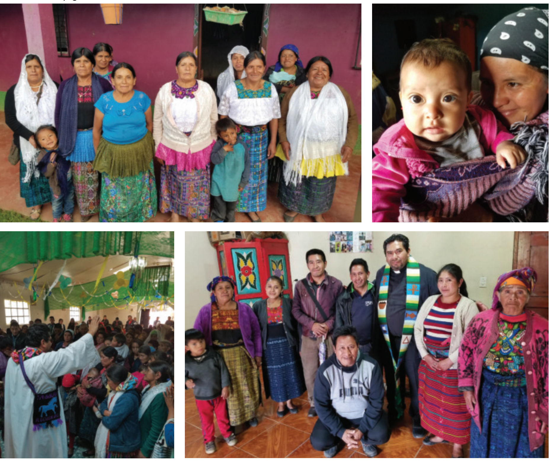
Continuado de la página 19