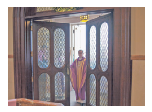
El Obispo Medley abre la Puerta Santa el 13 de dic. del 2015.