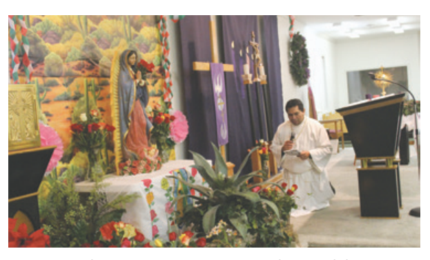
La misa en honor a Nuestra Señora de Guadalupe en la iglesia católica del San Miguel Arcangel, Sebree, Kentucky.