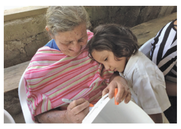
A Water Woman from Honduras writes on the water container while a young girl looks on.

The Jubilee Year of Mercy was established by Pope Francis to last from Dec. 8, 2015 to Nov. 20, 2016. As a special series celebrating the Works of Mercy, The Western Kentucky Catholic is highlighting stories of individuals who live these Works around the Diocese of Owensboro. This month's article tells the story of Water With Blessings, whose mission for clean drinking water exemplifies the Work "Give Drink to the Thirsty."