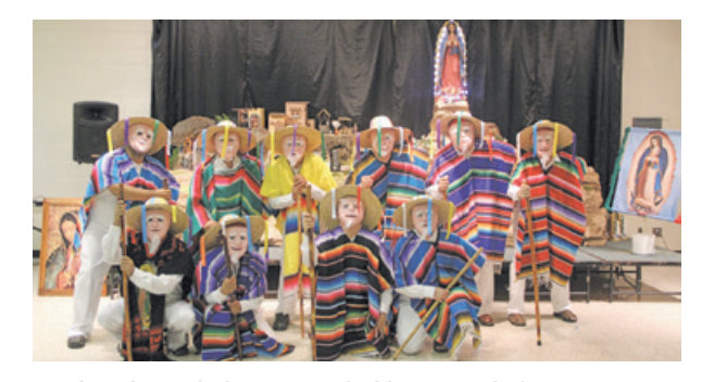
Los hombres de la comunidad hispana de la parroquia Santo Nombre de Jesús posan para una foto después de bailar la danza folclórica "Danza de los Viejitos" típica de Michoacán, formada a través de ritmos antiguos e instrumentos tradicionales.