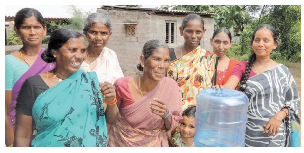
A group of Water Women in India smile as they look at the container of purified water that can now be easily accessed by numerous families.