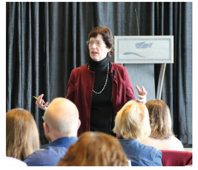
Sherry Weddell, author of "Forming Intentional Disciples," speaks during the "Living a Eucharistic Life as Missionary Disciples" conference in Owensboro on Oct. 22, 2022.