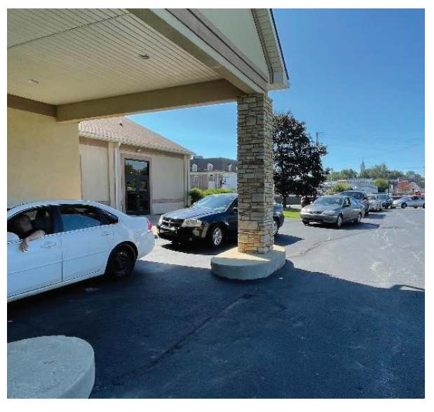
Cars line up to receive bags of food at St. Mary Parish in Franklin, Ky.

As the volunteers gathered Sep. 13, 2022, they did not know that a large crowd was headed their way. They had a total of 75 families that day lined up outside the church in their vehicles waiting to get food. I guess the word was passed along on the amount of food that the conference had and now