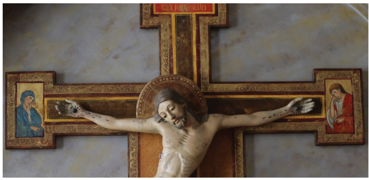
A crucifix is pictured at a Maryland Catholic church.

Our home is a "domestic church," and it is a holy place. Think about it: your home is inhabited by people who belong to God through baptism, are confirmed in the Holy Spirit, sanctified through the grace of the Sacrament of Marriage and fed