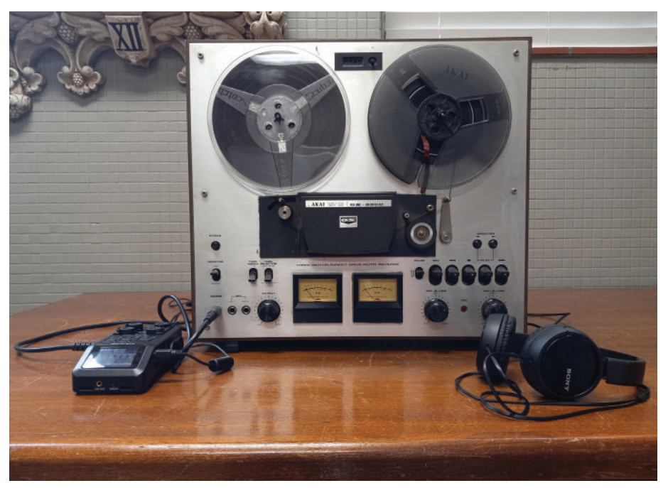
The equipment for the archives' in-house digitization of reel-to-reel tapes.