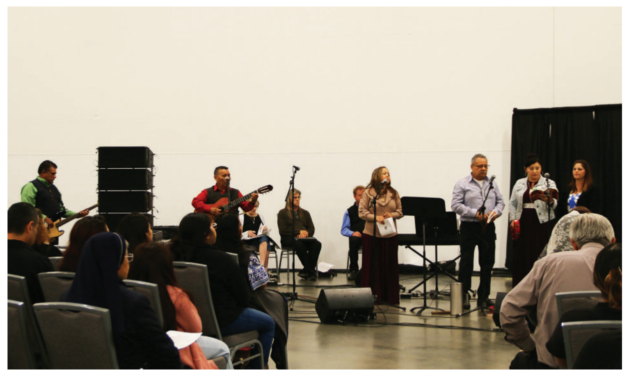
Los músicos guían a los fieles en los cantos durante la Misa de apertura de la conferencia "Viviendo vidas eucarísticas como discípulos misioneros" en Owensboro el 22 de octubre de 2022.